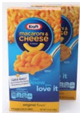
mac n cheese

As we celebrate Catholic Schools Week, we acknowledge Wednesday, February 2 as Celebrate Service Day . Help HT, help others. When asked, the HT Food Bank was happy to make some suggestions. Donations may be dropped off at the school office or sent to school with your student. If you are able, donations of the following are appreciated: