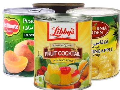
canned fruit/fruit cocktail/applesauce