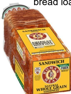
bread loaves-white or wheat