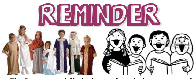
The Pageant and Choir sign-up form is due tomorrow!