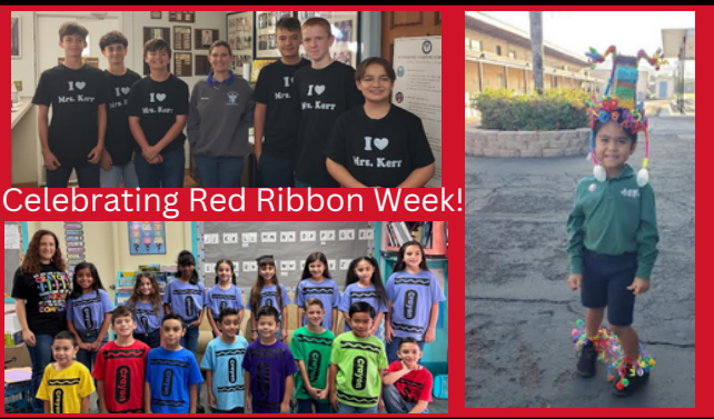
Celebrating Red Ribbon Week!

Important: Please return whole packet for new pictures.